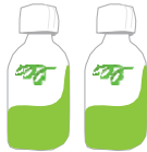
Two bottles of CLENPIQ (5.4 oz each)